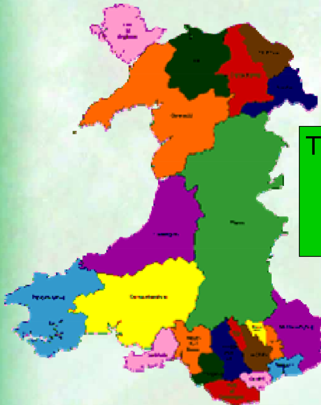
The 22 unitary local authorities in Wales