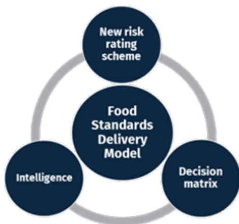
Figure A1.1 The three elements of the proposed new food standards delivery model