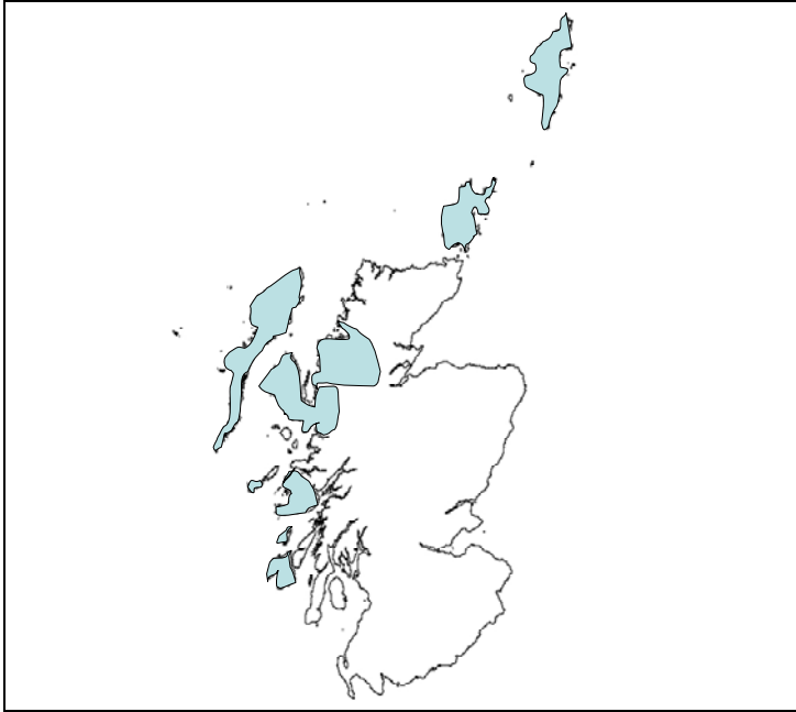
Figure 1 Areas where seaweed is used as a soil conditioner for crops (shaded in light blue)

predominantly used on the west coast of Scotland and offshore islands are shown in Figure 1 (crops) and Figure 2 (feed for animals).