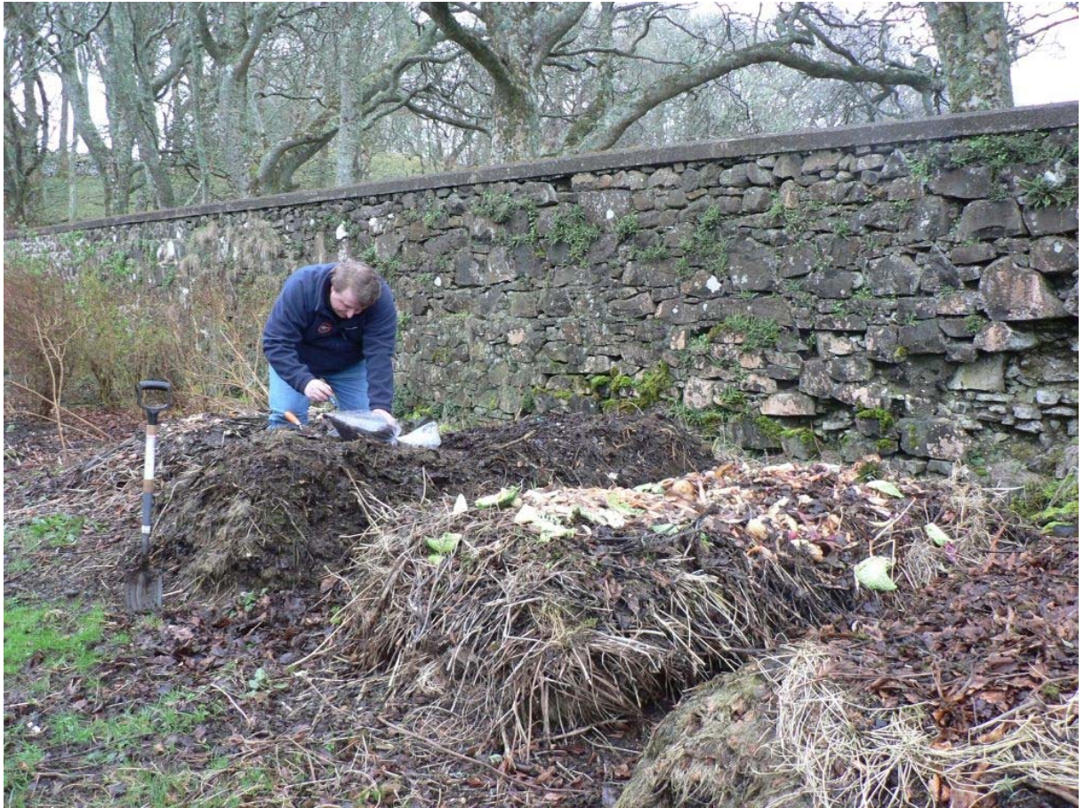
Figure 7 Example of compost made with seaweed