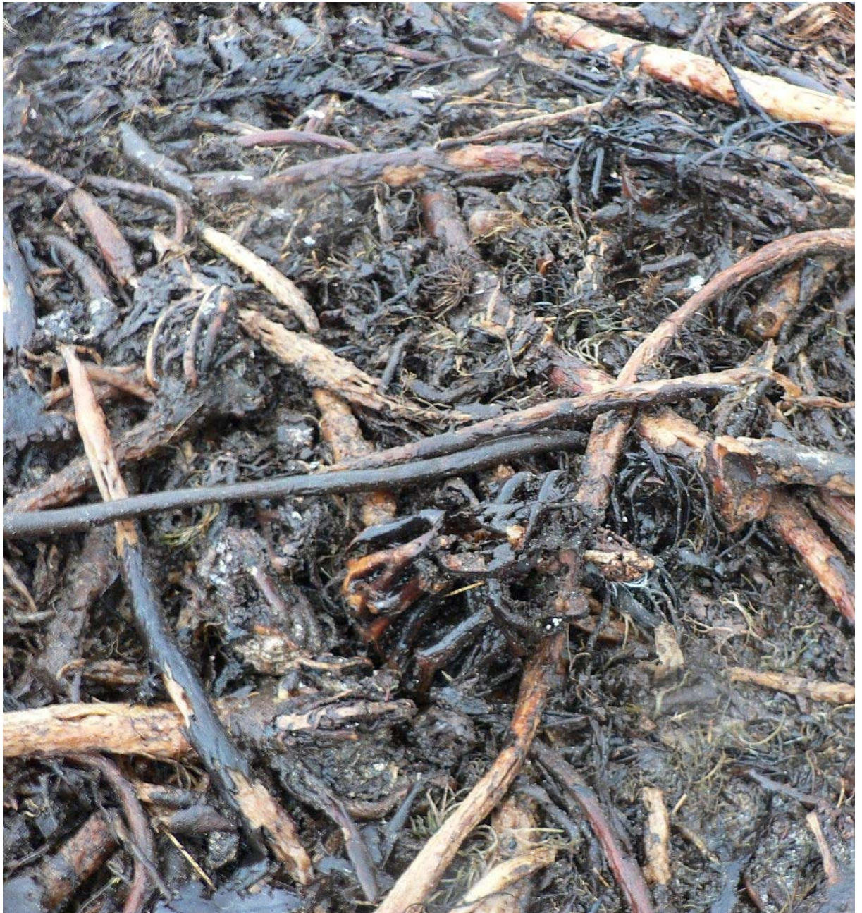
Figure 5 Pile of rotting seaweed

seaweed. For vegetable plots, the seaweed is usually dug in when it has rotted down, although in one location, plants were being planted through the seaweed layer. Seaweed used as mulch is left to rot down naturally and is sometimes applied several times over the year as required.