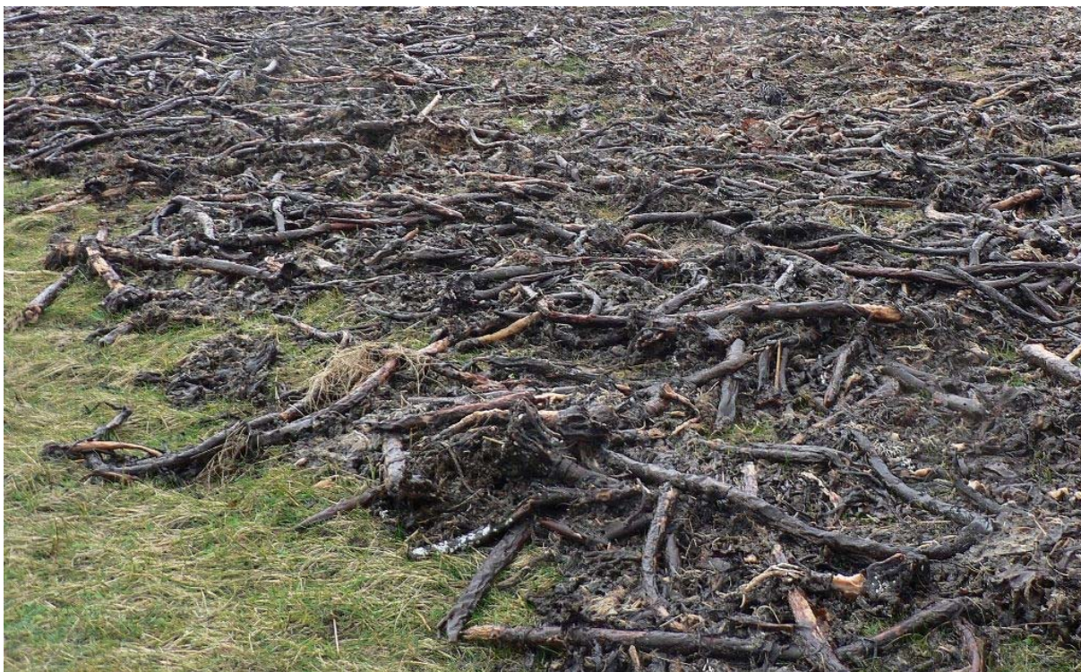
Figure 4 Area of machair used for growing potatoes; seaweed applied