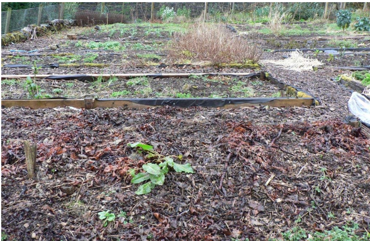
Figure 3 Example of raised beds for growing vegetables