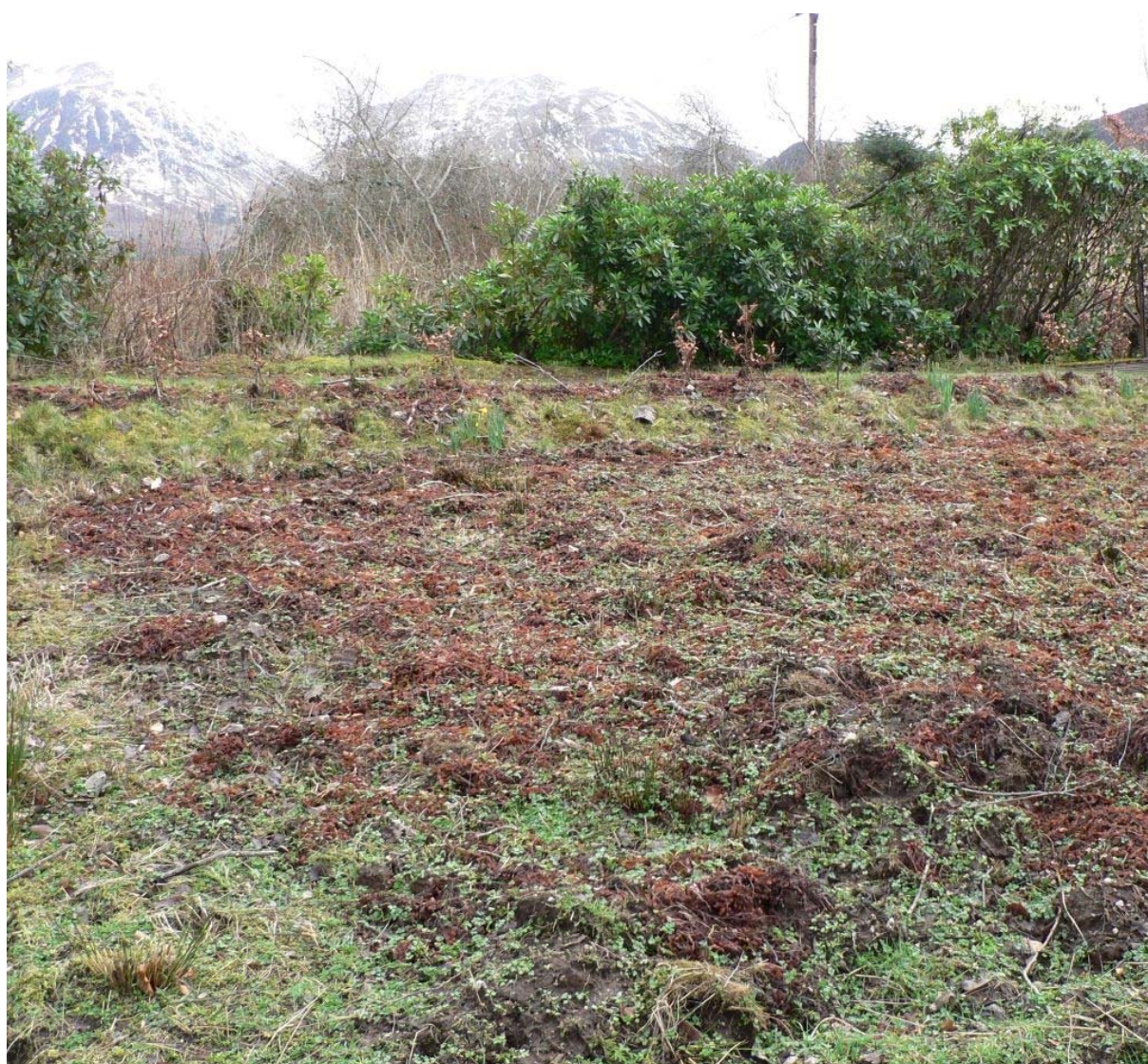
Figure 6 Seaweed spread on a vegetable plot where it has largely rotted down