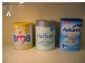
Powdered formula milk/ Powdered infant formula