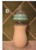
Made-up / reconstituted powdered formula milk feed / formula feed